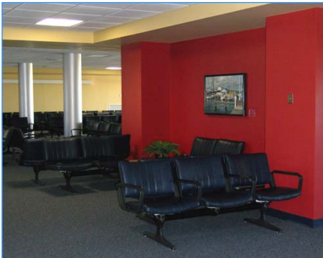
New paint, carpet and ceiling tiles give Gates 9-12 a fresh look and shows off the airport’s public art collection.

In 2005, there were 207,944 aircraft operations on St. Petersburg-Clearwater International Airport’s runways. Less than 3% were passenger airlines, 1.5% cargo, and less than 8% military operations. Over 88% were general aviation; comprised of corporate and private aircraft.